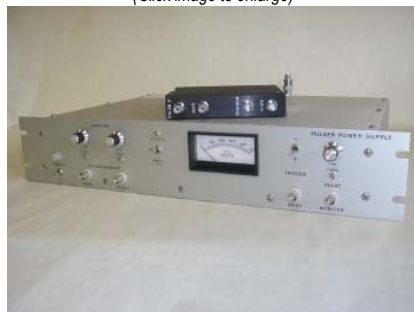
D-1040 High Voltage Pulser and D-1003 Power Supply