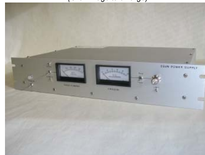
D-903 Electron Gun Power Supply