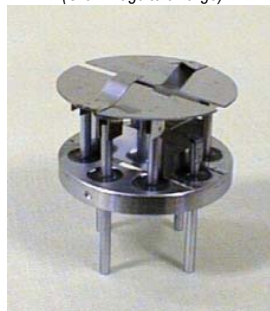
Electron Gun Filament Assembly