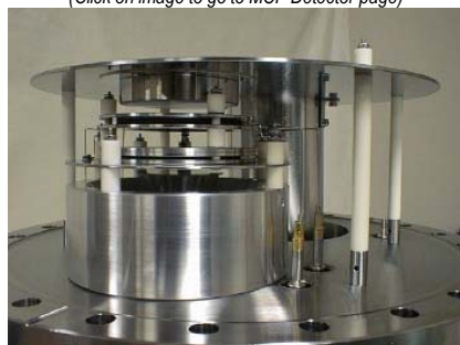
40mm Z-Gap MCP Detector Mounted on AREF (RETOF)

(Click on image to go to MCP Detector page)