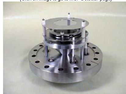
40mm MCP Dual Detector on 6 Inch Conflat Flange

(Click on image to go to MCP Detector page)