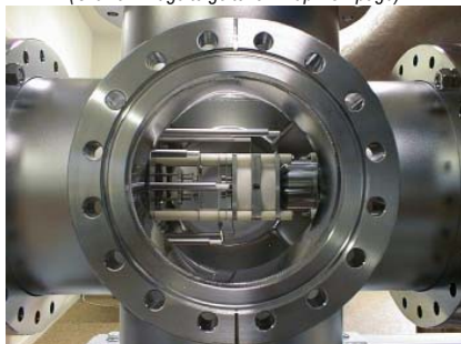
C-1550 Ion Trap EGUN Mounted on D-1450 ITRETOF

(Click on image to go to Ion Trap TOF page)