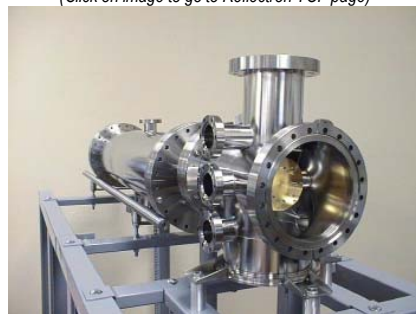
D-850 AREF (RETOF) Components

(Click on image to go to Reflectron TOF page)