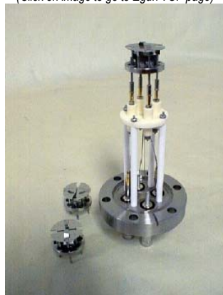
Egun Mounted on 2.75 Conflat Flange