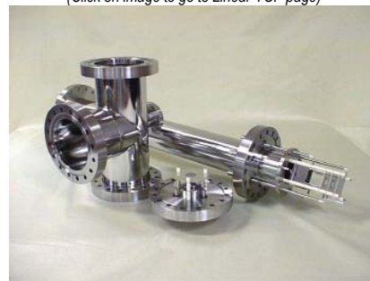
C-677 Linear Time Of Flight Mass Spectrometer Shown Here With MCP Detector and Sideport TEE

(Click on image to go to Linear TOF page)