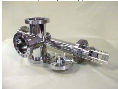
C-677 Linear Time Of Flight Mass Spectrometer Shown Here With MCP Detector and Sideport TEE