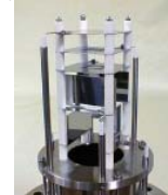
C-677 Ion Source Assy

The complete instrument consists of the following: