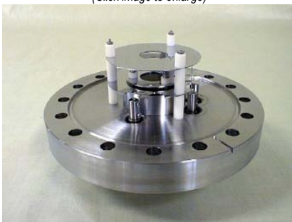
C-701 18mm Dual MCP Detector Assy