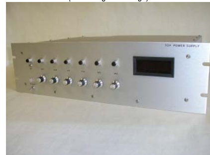
D-603 TOF Power Supply